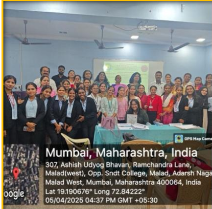
Mumbai, Maharashtra, India

307, Ashish Udyog Bhavan, Ramchandra Lane, Malad(west), Opp. Sndt College, Malad, Adarsh Nagar, Malad West, Mumbai, Maharashtra 400064, India Lat 19.190676° Long 72.84222° 05/04/2025 04:37 PM GMT +05:30