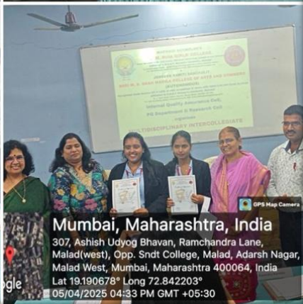
Mumbai, Maharashtra, India

307, Ashish Udyog Bhavan, Ramchandra Lane, Malad(west), Opp. Sndt College, Malad, Adarsh Nagar, Malad West, Mumbai, Maharashtra 400064, India Lat 19.190721° Long 72.842171° 05/04/2025 04:35 PM GMT +05:30