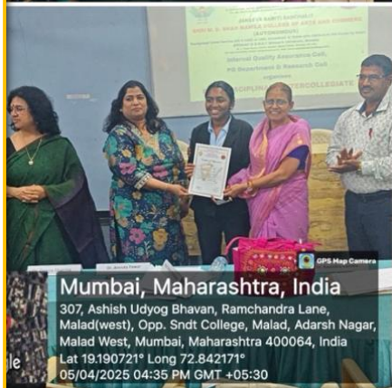
Mumbai, Maharashtra, India

307, Ashish Udyog Bhavan, Ramchandra Lane, Malad(west), Opp. Sndt College, Malad, Adarsh Nagar, Malad West, Mumbai, Maharashtra 400064, India Lat 19.190678° Long 72.842216° 05/04/2025 04:34 PM GMT +05:30