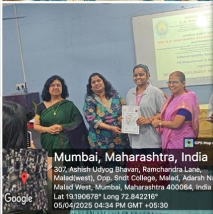
Mumbai, Maharashtra, India

307, Ashish Udyog Bhavan, Ramchandra Lane, Malad(west), Opp. Sndt College, Malad, Adarsh Nagar, Malad West, Mumbai, Maharashtra 400064, India Lat 19.190678° Long 72.842216° 05/04/2025 04:34 PM GMT +05:30