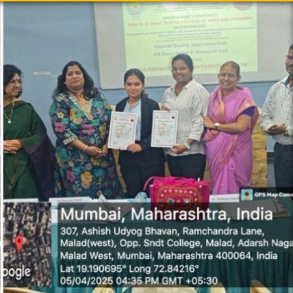
Mumbai, Maharashtra, India

307, Ashish Udyog Bhavan, Ramchandra Lane, Malad(west), Opp. Sndt College, Malad, Adarsh Nagar, Malad West, Mumbai, Maharashtra 400064, India Lat 19.190676° Long 72.84222° 05/04/2025 04:37 PM GMT +05:30