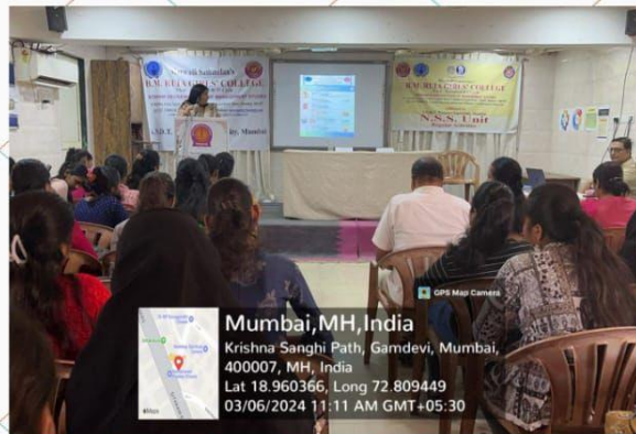
Mumbai,MH,India Krishna Sanghi Path, Gamdevi, Mumbai, 400007, MH, India Lat 18.960366, Long 72.809449 03/06/2024 11:11 AM GMT+05:30