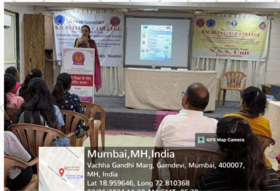
Mumbai,MH,India Vachha Gandhi Marg, Gamdevi, Mumbai, 400007, MH, India Lat 18.959646, Long 72.810368 03/06/2024 11:23 AM GMT+05:30