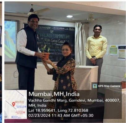
Mumbai, MH, India Vachha Gandhi Marg, Gamdevi, Mumbai, 400007, MH, India Lat 18.959641, Long 72.810368 02/23/2024 11:43 AM GMT+05:30