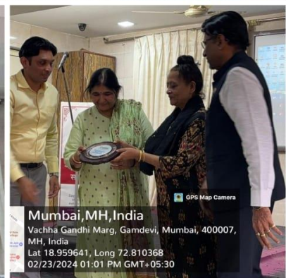
Mumbai, MH, India Vachha Gandhi Marg, Gamdevi, Mumbai, 400007, MH, India Lat 18.959641, Long 72.810368 02/23/2024 01:01 PM GMT+05:30