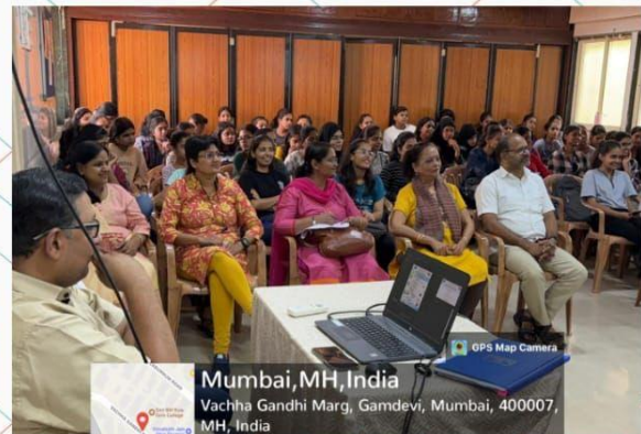
Mumbai,MH,India Vachha Gandhi Marg, Gamdevi, Mumbai, 400007, MH, India