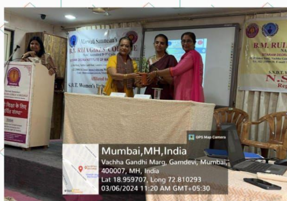
Mumbai,MH,India Vachha Gandhi Marg, Gamdevi, Mumbai, 400007, MH, India Lat 18.959707, Long 72.810293 03/06/2024 11:20 AM GMT+05:30