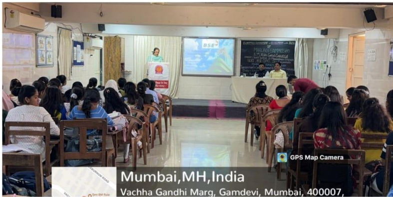
Mumbai, MH, India Vachha Gandhi Marg, Gamdevi, Mumbai, 400007,