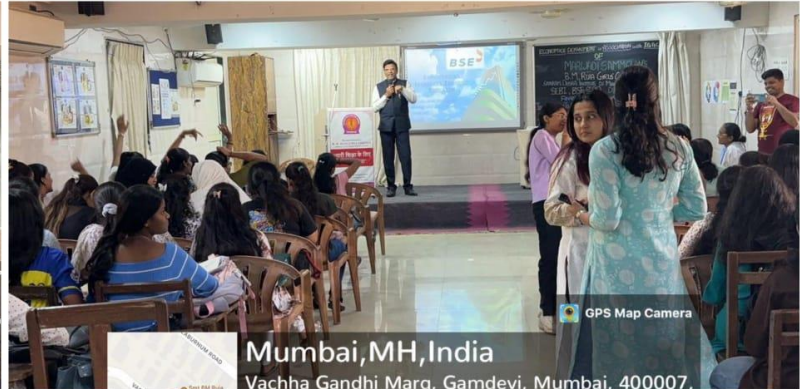
Mumbai, MH, India Vachha Gandhi Marg, Gamdevi, Mumbai, 400007,