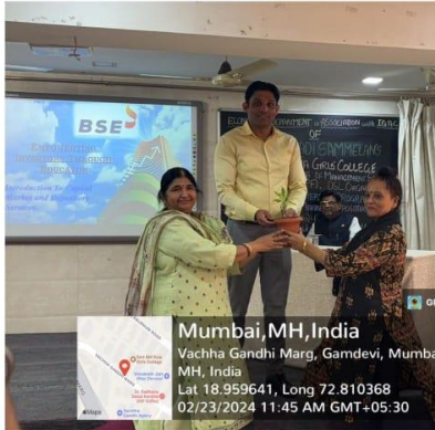
Mumbai, MH, India Vachha Gandhi Marg, Gamdevi, Mumbai, MH, India Lat 18.959641, Long 72.810368 02/23/2024 11:45 AM GMT+05:30