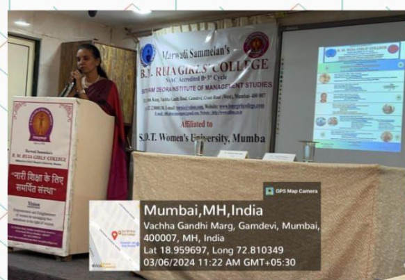
Mumbai,MH,India Vachha Gandhi Marg, Gamdevi, Mumbai, 400007, MH, India Lat 18.959697, Long 72.810349 03/06/2024 11:22 AM GMT+05:30