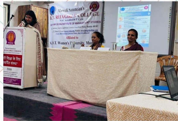
Mumbai,MH,India Vachha Gandhi Marg, Gamdevi, Mumbai, 400007, MH, India