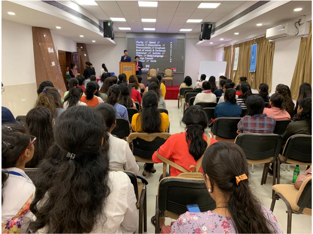
Educational Visit to Securities Exchange Board of India (SEBI)