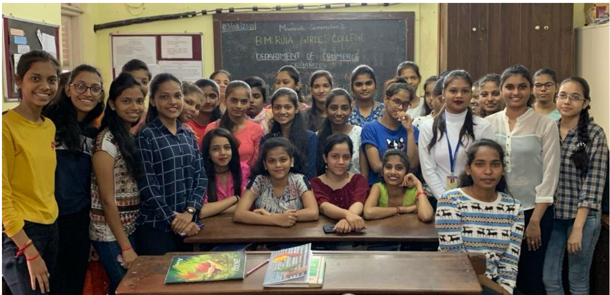
An Educational Visit to RBI Monetary Museum was organized on 5 th March, 2020