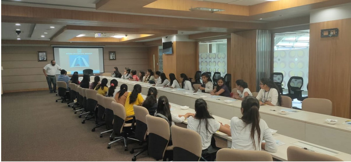
Extempore and Group Discussion on Women Empowerment on 3 rd March 2020