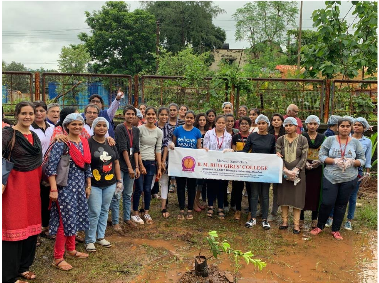
Educational Visit to Bisleri Water Plant